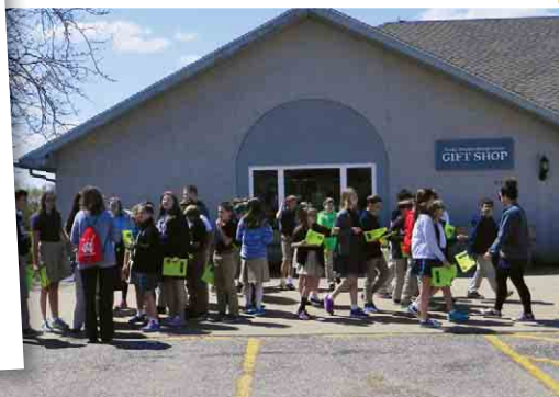
The 5th grade class from across the Diocese visits Trinity Heights May 4th.