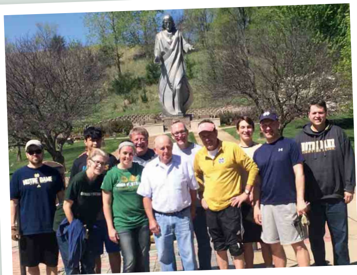
The Sioux City Notre Dame Club May 6, 2017 at Trinity Heights

On May 6, the Notre Dame Club of Sioux City returned to Trinity Heights to assist in an assortment of grounds clean-up. This group continues to bless Trinity Heights with their hard work every year. This year a great group showed up to offer their assistance in a clean-up of the newly renovated Stations of the Cross area of the Outdoor Cathedral here at Trinity Heights. Their efforts are so very much appreciated, as we continue to maintain our grounds, over 16 acres with a very small staff, and group of volunteers. The Notre Dame Club started their morning with the First Saturday Mass at the Divine Mercy Chapel, and then headed out onto the grounds and accomplished a great deal while they were here. We thank all from the Notre Dame Club who came to work this year, and every year they continue to bless us with their services!